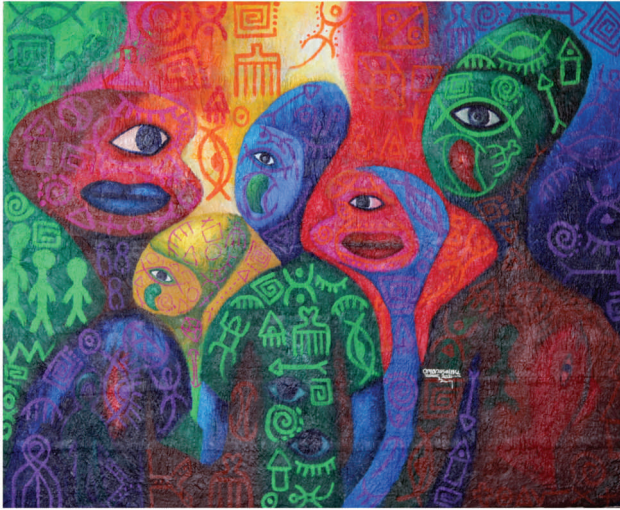
EYE OF PROVIDENCE 2 , acrylic on canvas, 107cm x 132cm, 2021 Eye of providence or the all-seeing eye shows enlightenment, spiritual awareness, and new understanding. Which means that no detail gets passed an artist or creator.