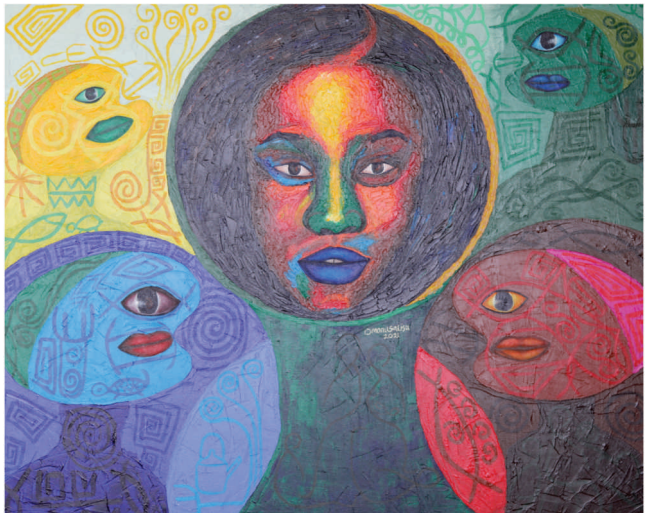
EYE OF PROVIDENCE 3 , acrylic on canvas, 107cm x 132cm, 2021 Eye of providence or the all-seeing eye shows enlightenment, spiritual awareness, and new understanding. Which means that no detail gets passed an artist or creator.