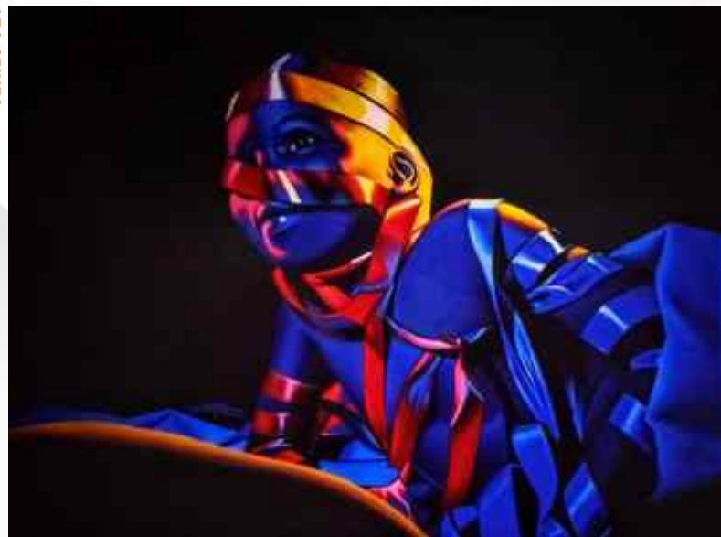
▲ RENDITION OF THE DAYS TO COME Oil on canvas 88cm x 117cm 2022