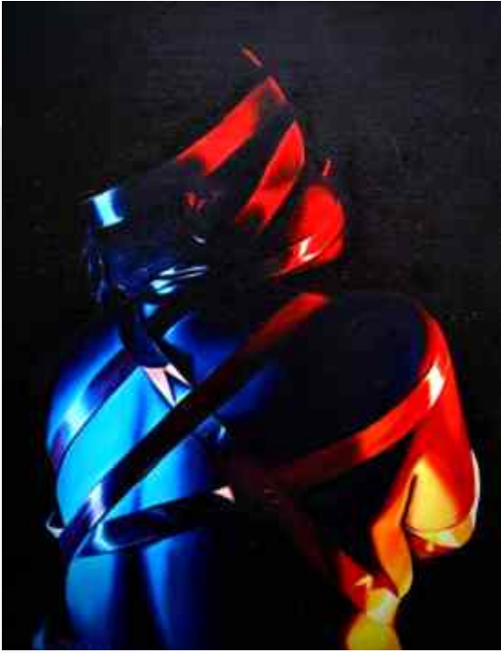
◀ OSUN (GODDESS OF FERTILITY, BEAUTY AND FRESH WATER) PART 1 Oil on canvas 76cm x 102cm 2021