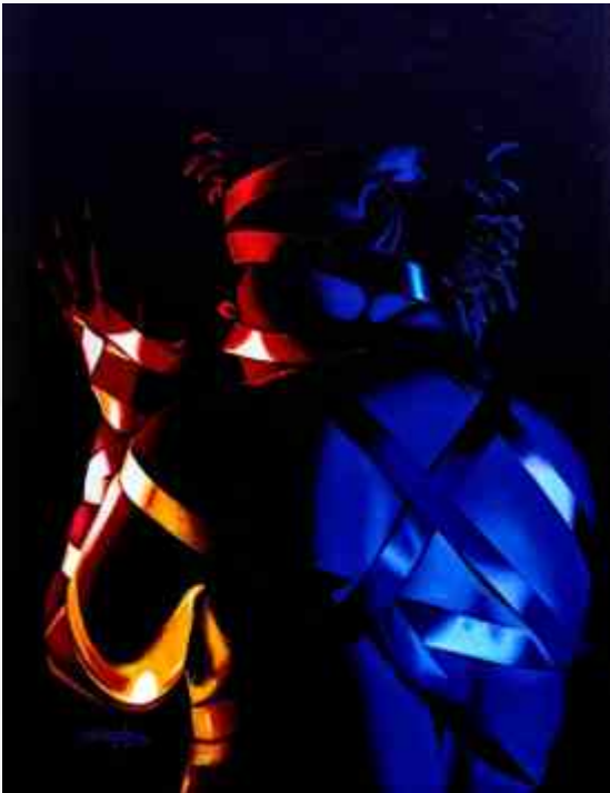
◀ OŞUN (GODDESS OF FERTILITY, BEAUTY AND FRESH WATER) PART 1 Oil on canvas 76cm x 102cm 2021