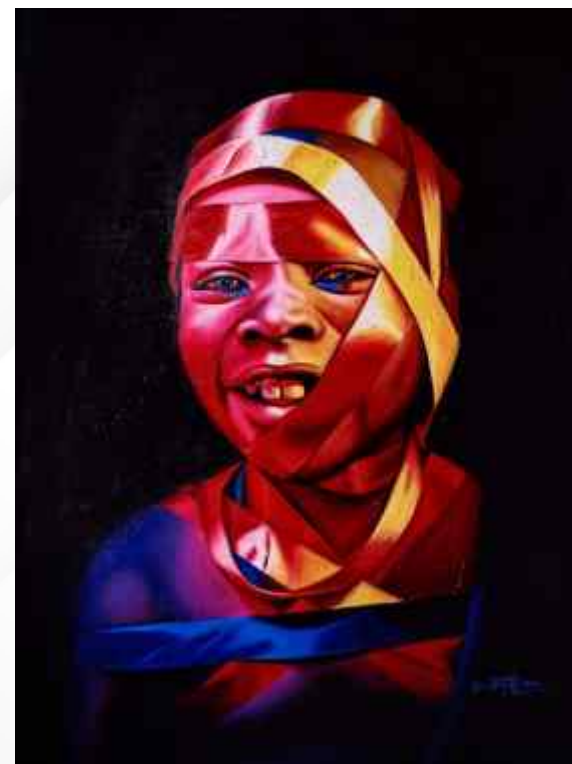
▶ ENDEARED WITHOUT A PRICE I Oil on canvas 76cm x 102cm 2021