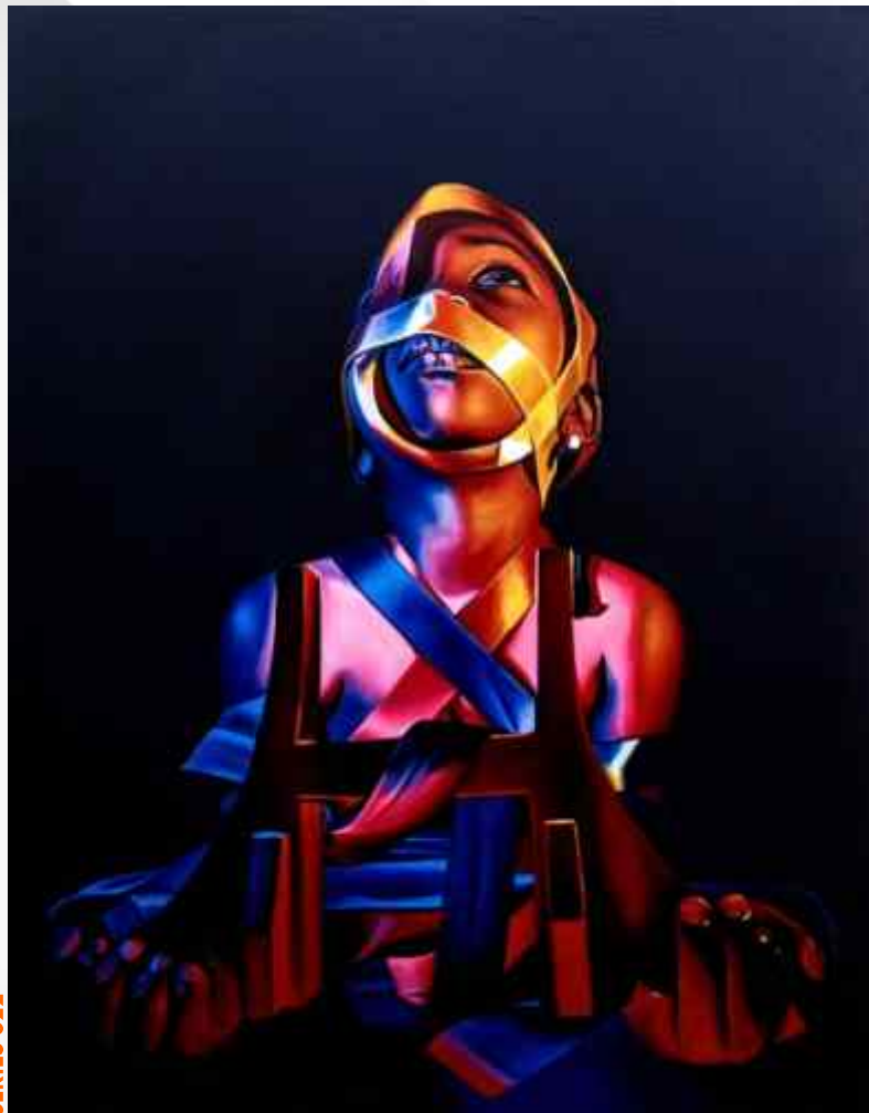
▲ KEEPER OF THE CITY Oil on canvas 102cm x 127cm 2022