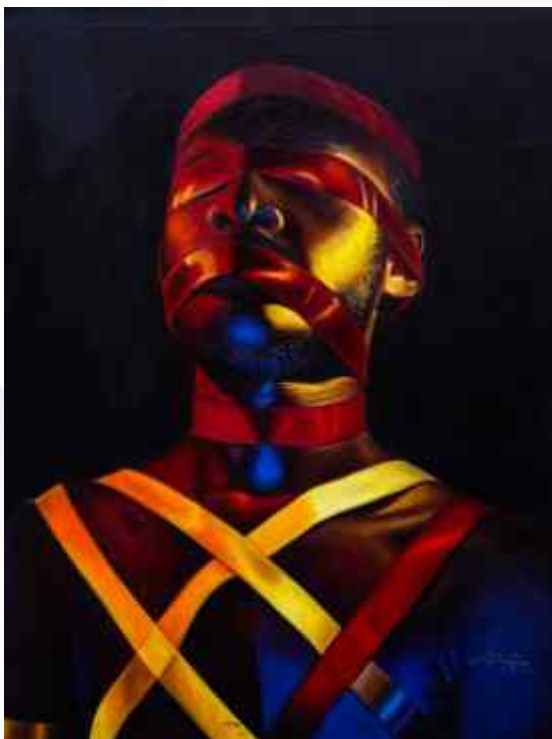
◀ ENTRUSTED FATE Oil on canvas 92cm x 99cm 2021