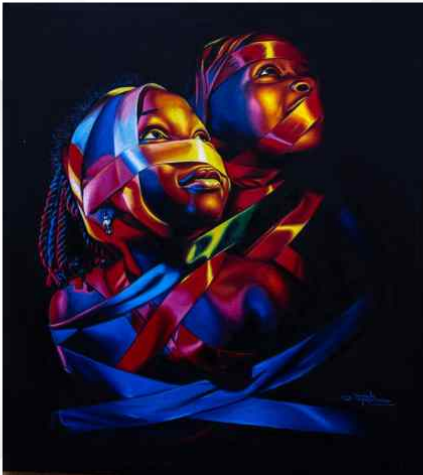
▲ IN NO DISTANT TIME Oil on canvas 96cm x 102cm 2021