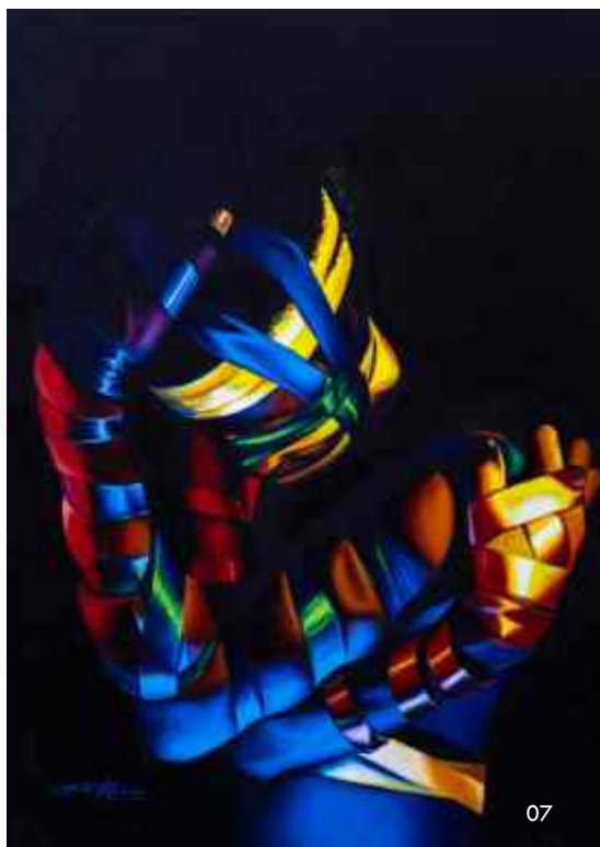
▶ SELF APPRAISAL II Oil on canvas 76cm x 102cm 2021