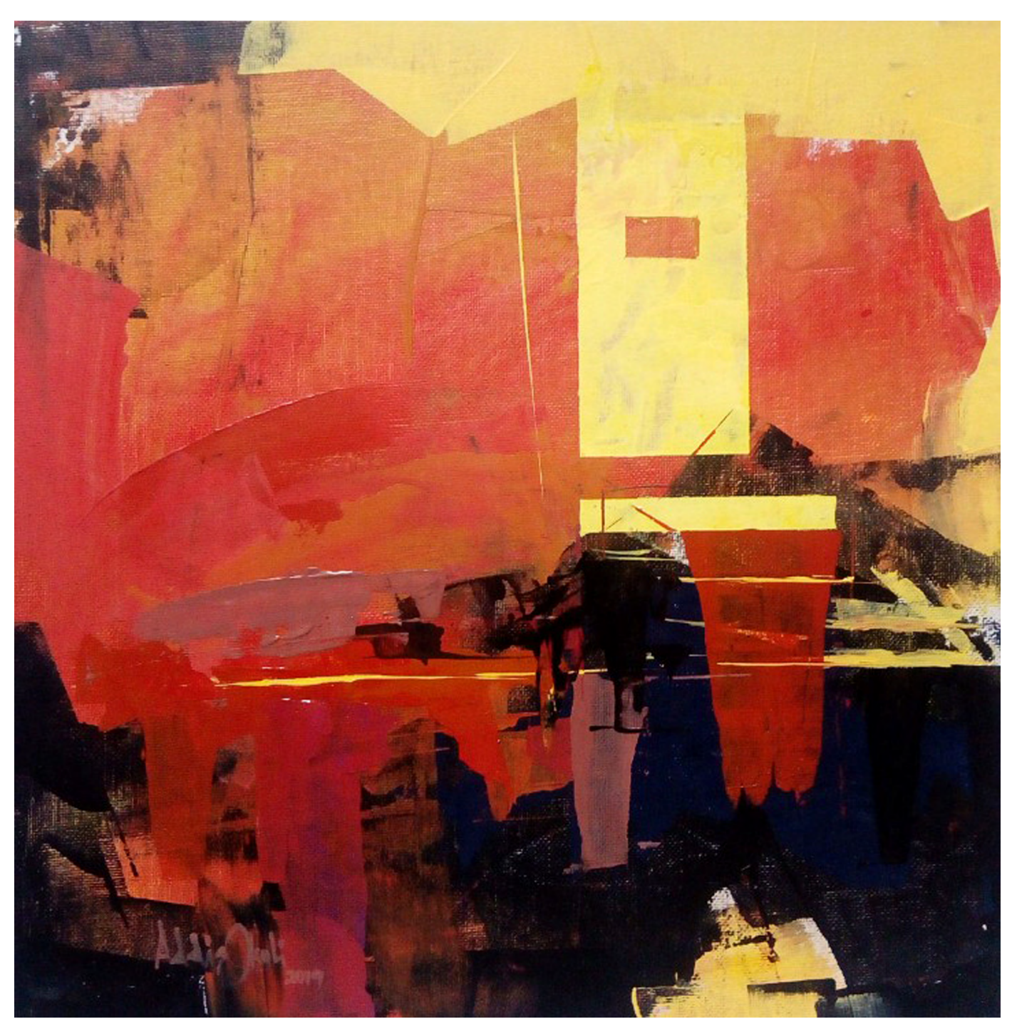
SUNSET Acrylic on canvas board 30cm x 30cm 2019