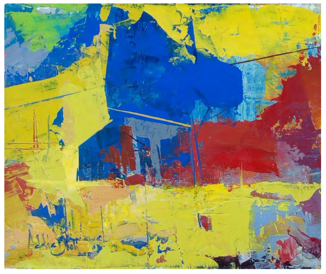
HERMIT Acrylic on canvas 24cm x 20cm 2020