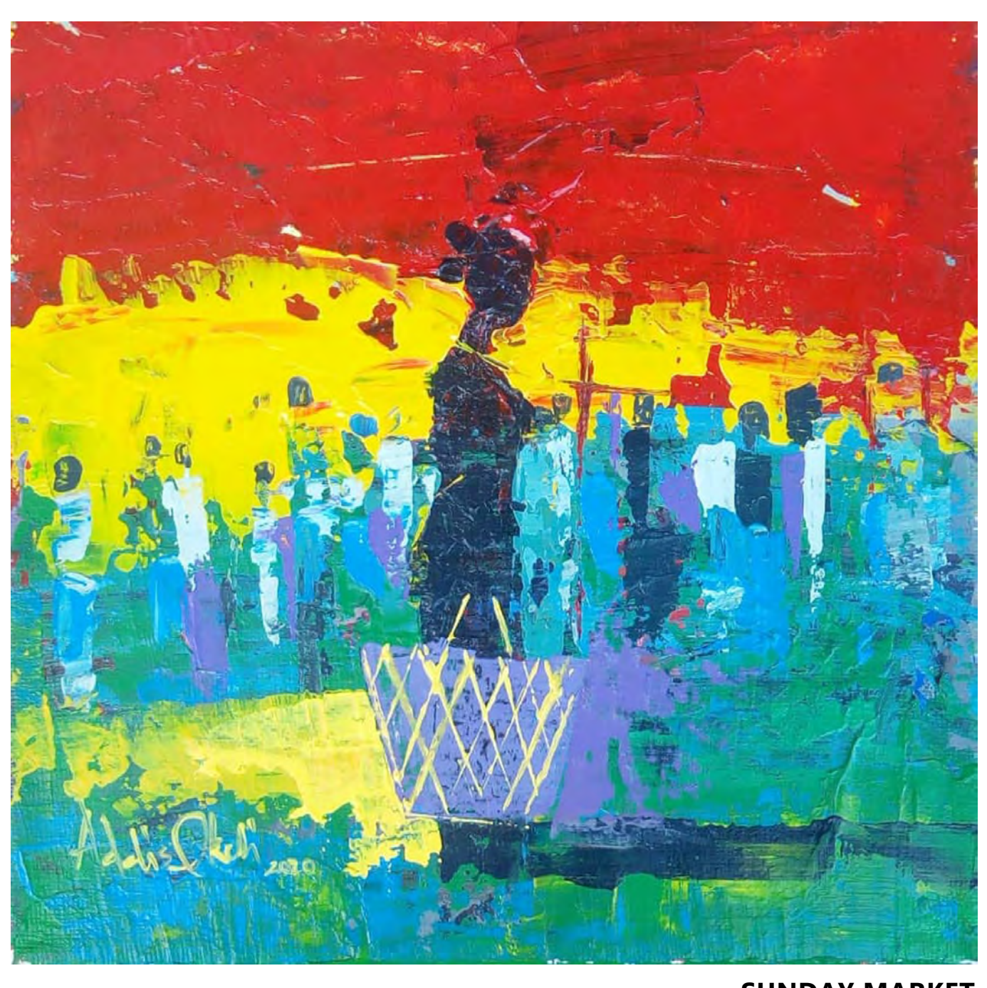
SUNDAY MARKET Acrylic on canvas 20cm x 20cm 2020