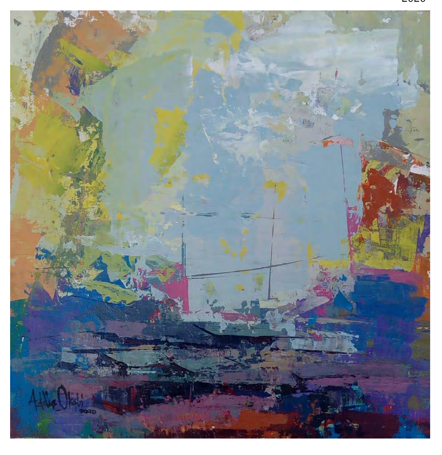
HARD LIFE Acrylic on canvas 30cm x 30cm 2020