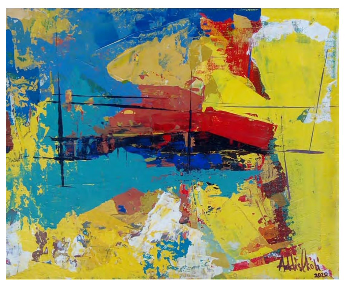
RURAL SHOPS Acrylic on canvas 24cm x 20cm 2020