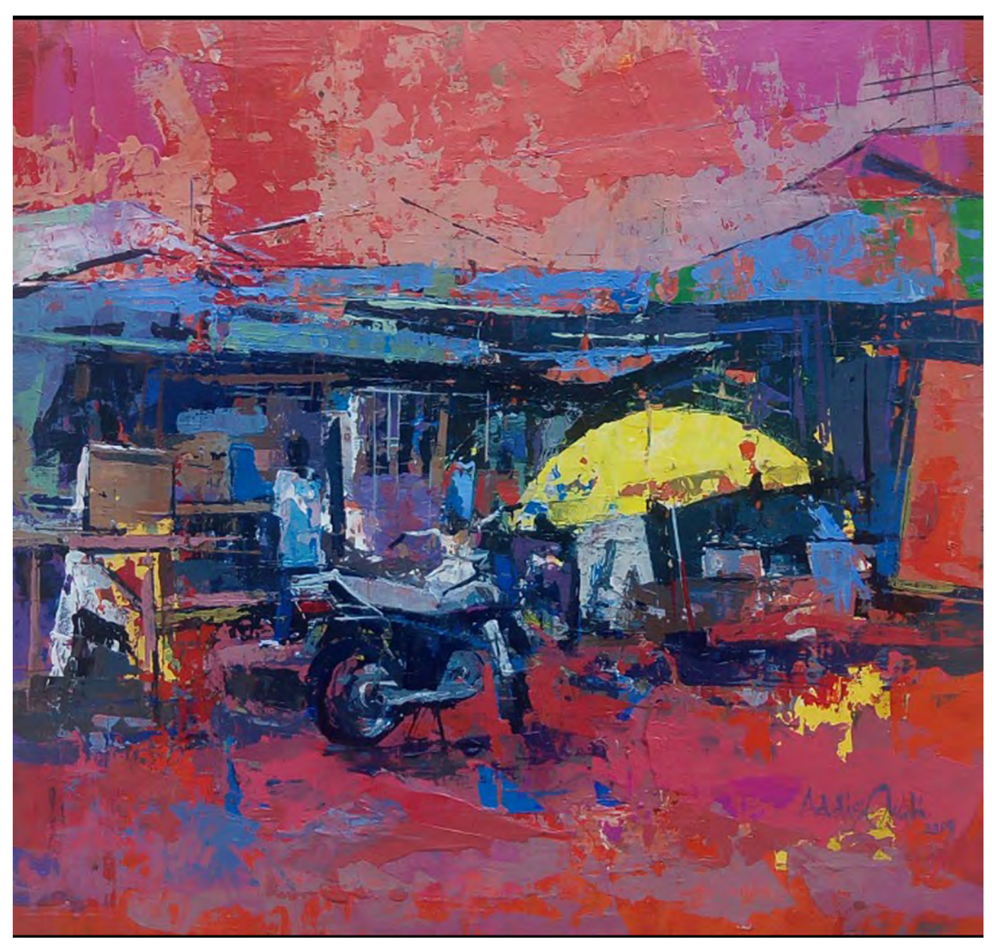
BREAK TIME Acrylic on canvas 34cm x 36cm 2019