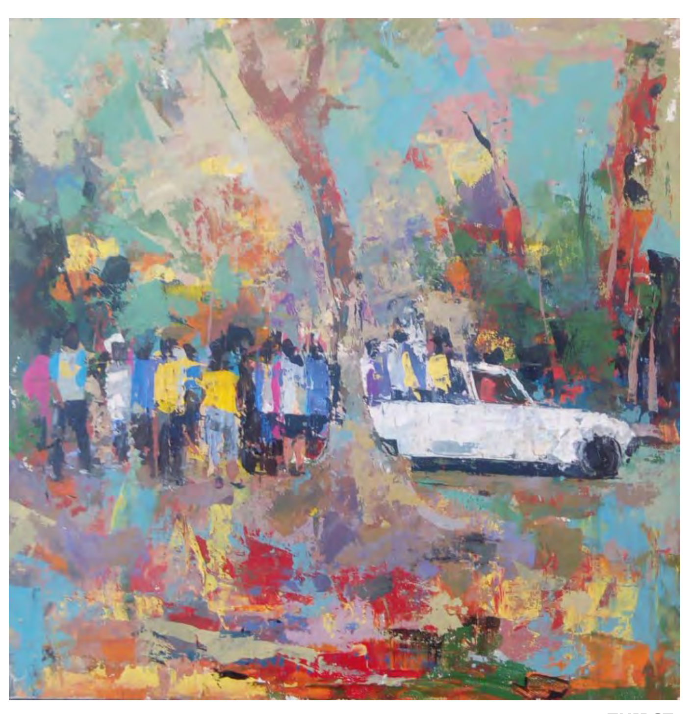
THIRST Acrylic on canvas 30cm x 30cm 2019