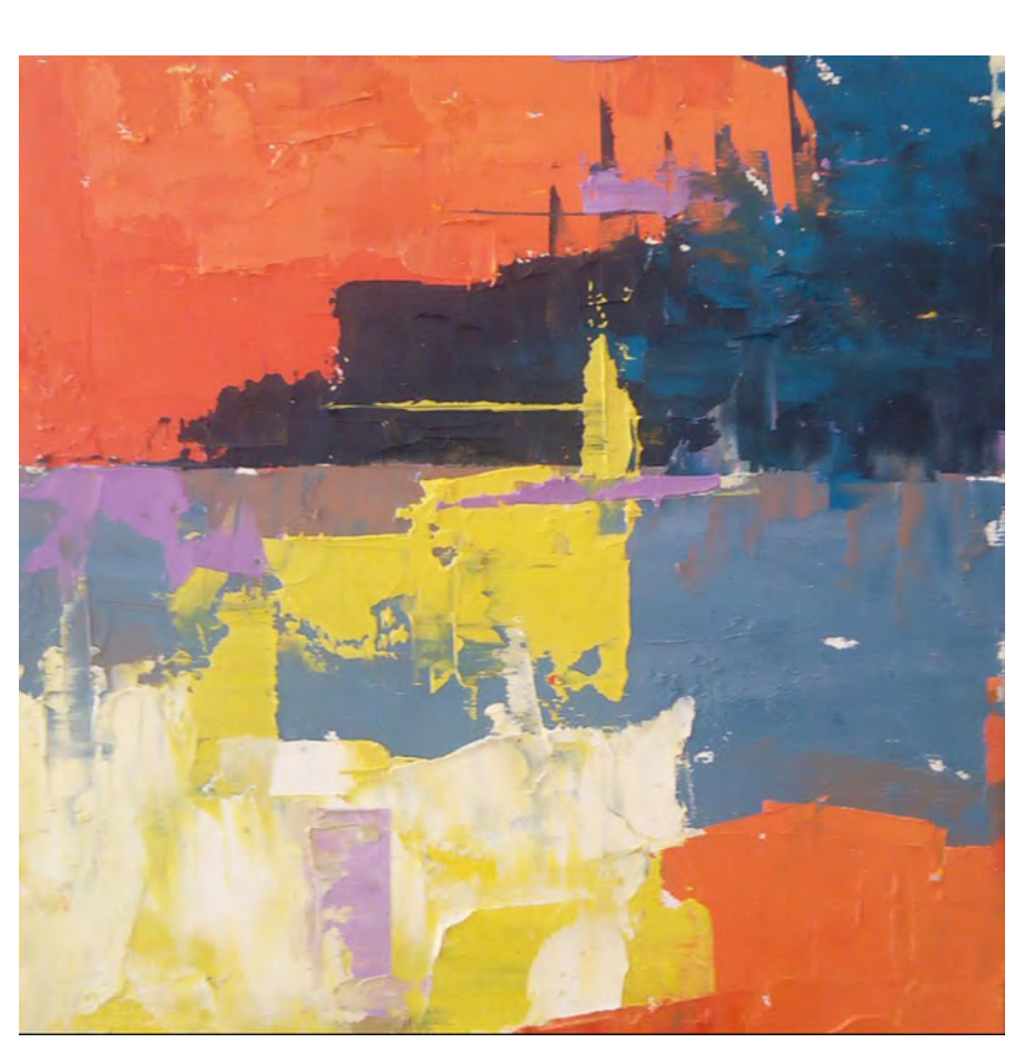
OTHER SIDE Acrylic on canvas board 20cm x 20cm 2019