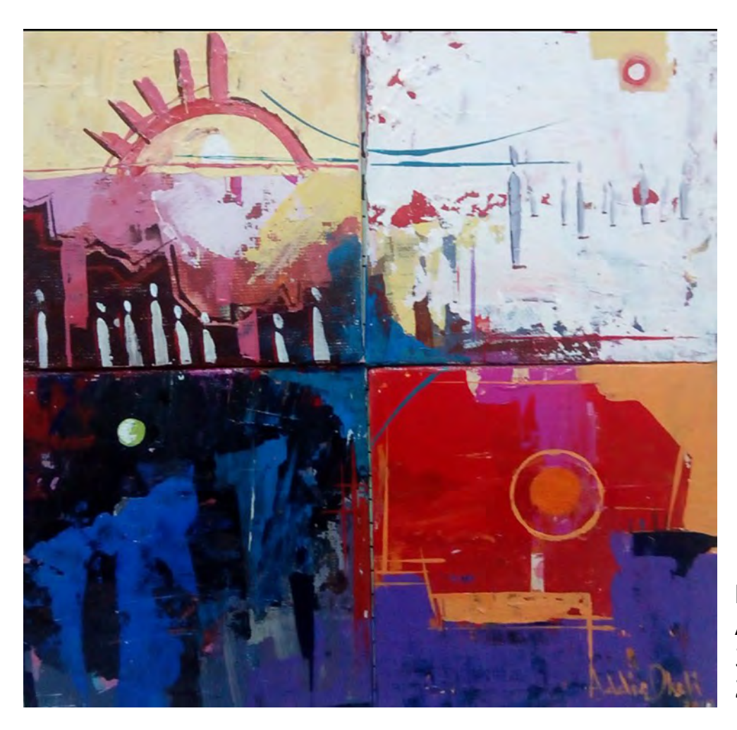
ROUND THE CLOCK Acrylic on canvas boards 30cm x 30cm 2019