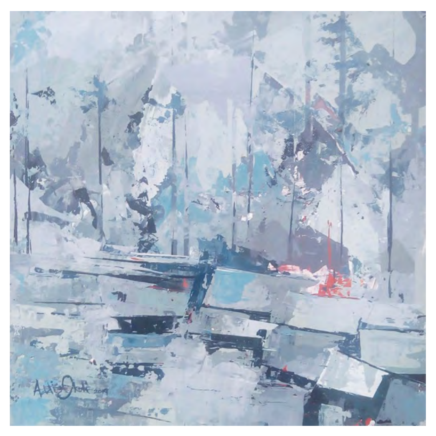
HIDDEN Acrylic on canvas board 30cm x 30cm 2019