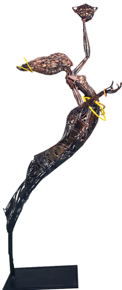
ALA (EARTH) (Reincarnation of Anyanwu Series) Mixed media 136cm 2021