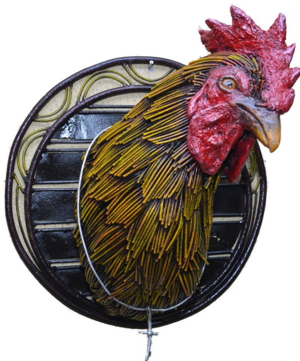
ROOSTER Mixed media 55cm 2021