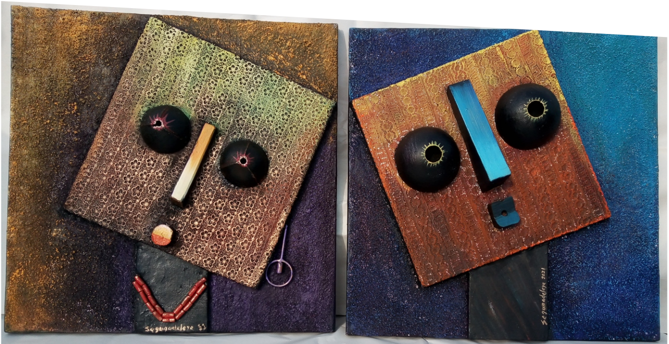
HAPPY HOME (BLESSED NATION) Mixed media 60.96cm x 60.96cm 2021