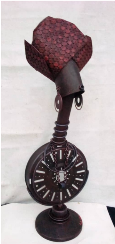
RED ANGEL Metal 92cm 2021