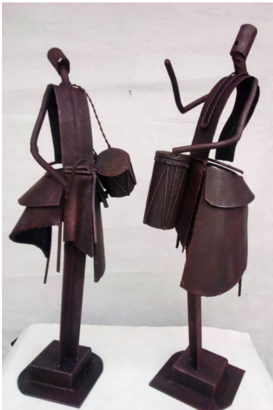
THE BEATS Metal 62cm 2020