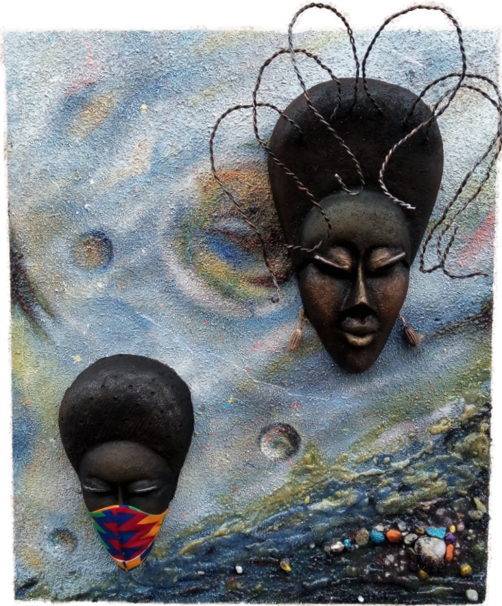
AFTER THE STORM Mixed media 81.28cm x 63.50cm 2021